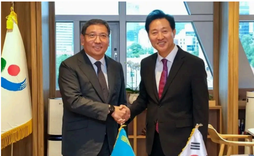
On the Left, Mayor of Almaty Mr. Erbolat Dossaev, on the right Mayor of Seoul Mr. Oh Se-hoon