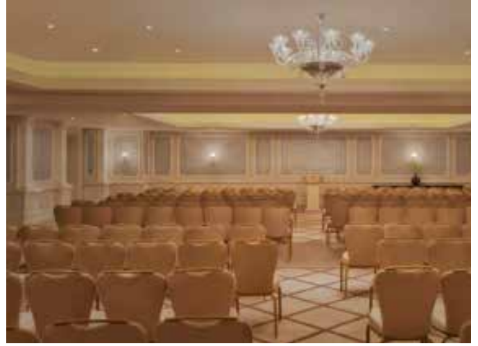
Siraselviler Meeting Room

Located in Taksim Gümüşsuyu, the heart of Istanbul, the new CVK Park Bosphorus Hotel Istanbul has risen from the ashes of the historic Park Hotel, which also served as “Foreign Affairs Palace” 120 years ago and is hosting its guests by assuming this hospitality mission. With its luxurious rooms and suites, 8500 m2 CVK Saphira Spa and fitness area, event and meeting venues, Istanbul’s largest terrace with Bosphorus view (4500 m2) and latest technology infrastructure, CVK Park Bosphorus Hotel Istanbul is destined to be the new attraction point of the city. 8 room and 4 suite categories at various sizes with city, garden and Bosphorus view, as well as 65 separate luxury suites, are offered to its special guests as a wide variety of selection.