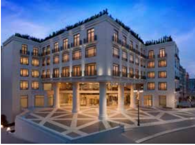
CVK Park Bosphorus Hotel